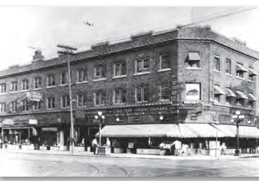
The Geanakoplos Building with Lakeview Confectionary