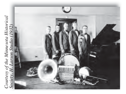
Orchestra that played at the Uptown Ballroom, Minneapolis in 1932. Orquesta que tocó en Uptown Ballroom, Minneapolis, en 1932.

Restaurants, fashionable theaters, top notch entertainment facilities, and unique retail shops were interspersed with everyday services, and public schools and libraries opened up to meet the needs of the growing community. In 1929, when local businessmen began to use the name "Uptown" to describe the area, Hennepin and Lake was solidly ensconced as the major shopping and entertainment district outside downtown.